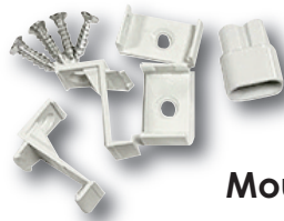
UCMCP Mounting Clips

UC250LL - 250mm / UC500LL - 500mm / UC1000LL - 1000mm